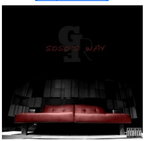
[SoSo's Way 2015]