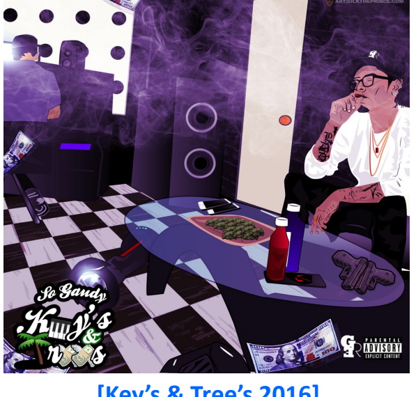
[Key's & Tree's 2016]