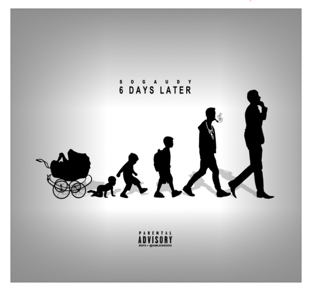
[6 Day's Later 2016]