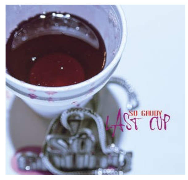
[Last Cup 2013]