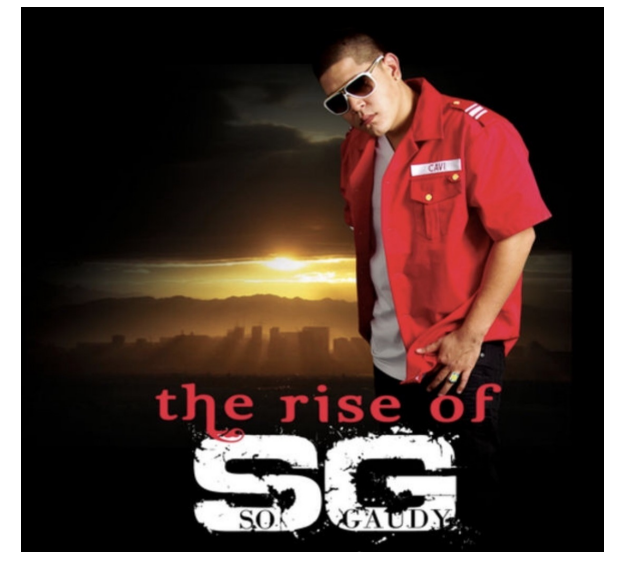
[The Rise of SO Gaudy 2010]

All media enclosed is the sole property of GRE Entertainment/SO GAUDY. © SO GAUDY 2017